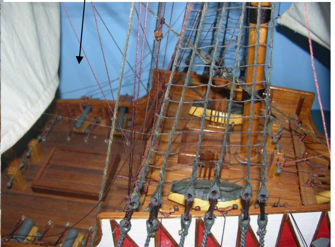
Detail of the foredeck on Col's model of Sir Francis Drake's Galleon the "Golden Hind", famous as first English ship to circle the globe