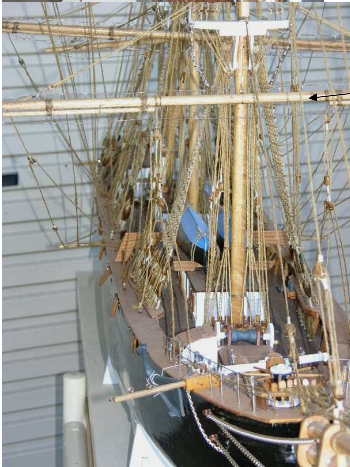
"The Engine Room" of the Clipper ship "Cutty Sark". All this rigging had to be maintained by the crew, often while rolling along in the Southern Ocean.