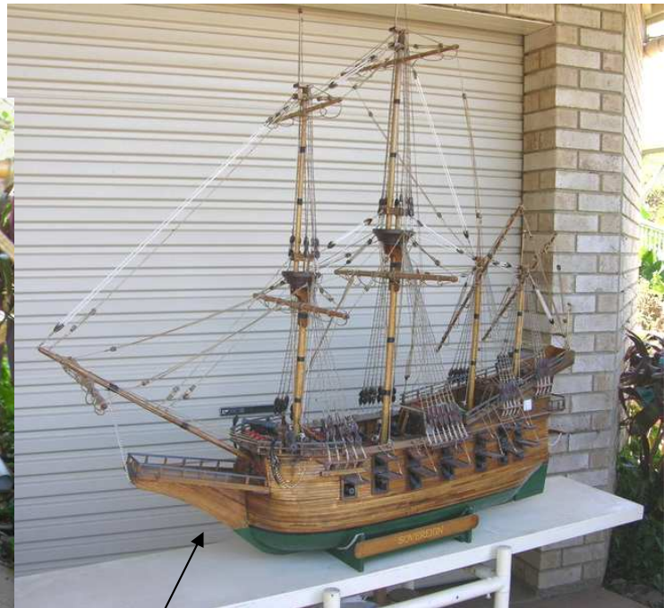
Col's model of "Sovereign" which was built as a trading ship in 1626. After being captured by pirates, and then recovered, her guns were doubled to 28 in total.